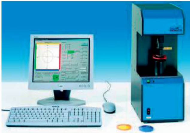
LensColour Analyser TFM-1

The system was developed in cooperation with Rodenstock GmbH, Munich, Germany.